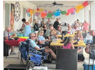
Fellowship, food and drink were enjoyed by all