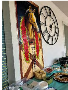
Some great décor and snacks