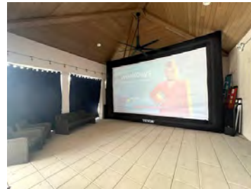
The big screen and blackout curtains enhanced Derby-viewing capabilities