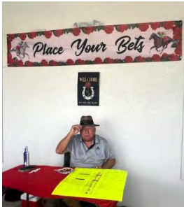
Off-track betting, anyone?