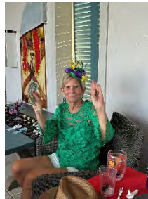
Elegant fascinator – a nod to the over-the-top hats at the real Derby